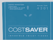
COSTSAVER® Interfold Toilet Tissue White, 17,5 x 11cm, 1ply, 200 sheets Order Code 4301