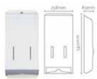
White and grey metal, lockable dispenser CODE 4944

Conventional hand towels have tightly compressed fibres which cause water to sit on top of the towel, slowing absorbency. KLEENEX® and SCOTT* towels with AIRFLEX* Fabric contain absorbency cells that soak up water fast, for superior hand drying performance.