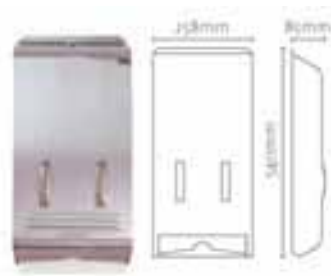
Stainless steel, lockable dispenser CODE 4950