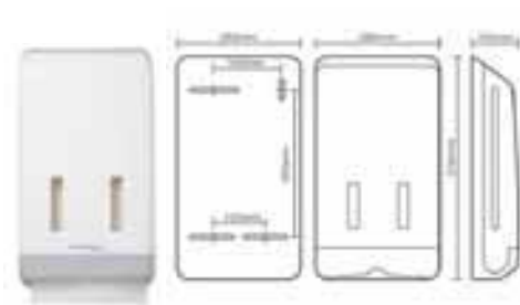
ABS white and grey plastic, lockable or snaplock dispenser CODE 4959